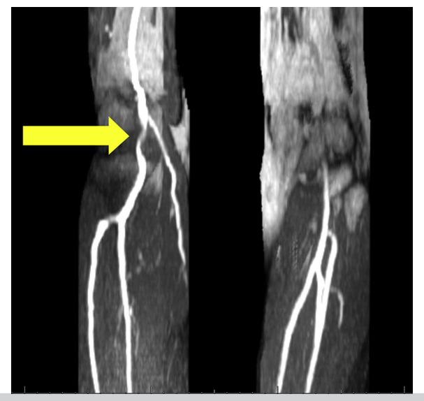
Fig 1. Magnetic resonance imaging (MRI) with time of flight imaging showing 70% focal stenosis of right popliteal artery ( arrow ).

was prescribed 81 mg aspirin daily and was discharged home on postoperative day 3. At her follow-up visit, she had a normal gait and palpable pedal pulses, and her foot was warm and well perfused. The ankle-branchial index was 0.9 on the right and 1.06 on the left, and duplex ultrasound confirmed a patent right popliteal artery. Perhaps most important, several months later she gave birth to a healthy baby boy. After her pregnancy, magnetic resonance angiography with contrast enhancement was performed and was negative for contralateral popliteal entrapment.